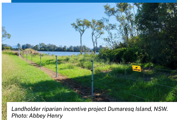
Landholder riparian incentive project Dumaresq Island, NSW.