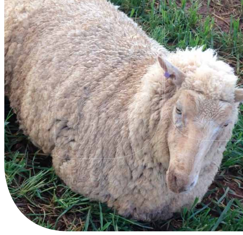
The classic hypocalcaemic ewe having given birth one week ago: lying down, bright and alert but unable to rise.

Prevention is better than the cure particularly with this disease. Once ewes are affected, supportive treatment is advised but often ineffective.