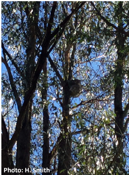
Koala sighted on a property at Mt Breckin in January this year.

Hunter LLS will be coordinating small group walks with landholders interested in learning more about what plants and animals are present. Walks will be held on agreed host properties, and will be led by an ecologist. There will be opportunity to learn more about habitat areas, involve in recording what is found and how to look for trace signs of animals.