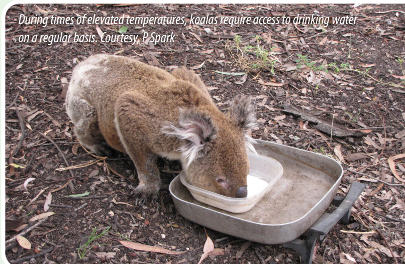
During times of elevated temperatures, koalas require access to drinking water on a regular basis.