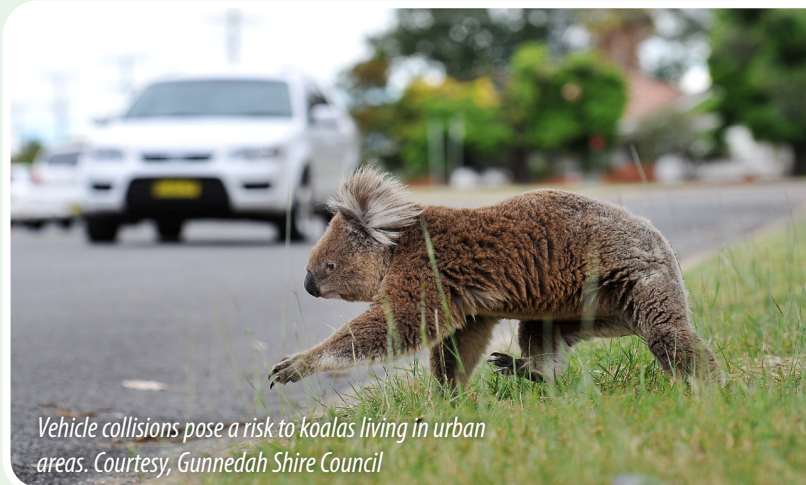
Vehicle collisions pose a risk to koalas living in urban areas.

The Koala has front and hind limbs of nearly equal length. Although it has no tail, the Koala has a great sense of balance and is an excellent climber. Long claws and rough pads on palms and soles assist in gripping tree trunks and branches. The Koala's large, leathery nose has a highly developed sense of smell that can differentiate between types of eucalyptus leaves and the levels of toxicity contained within them.