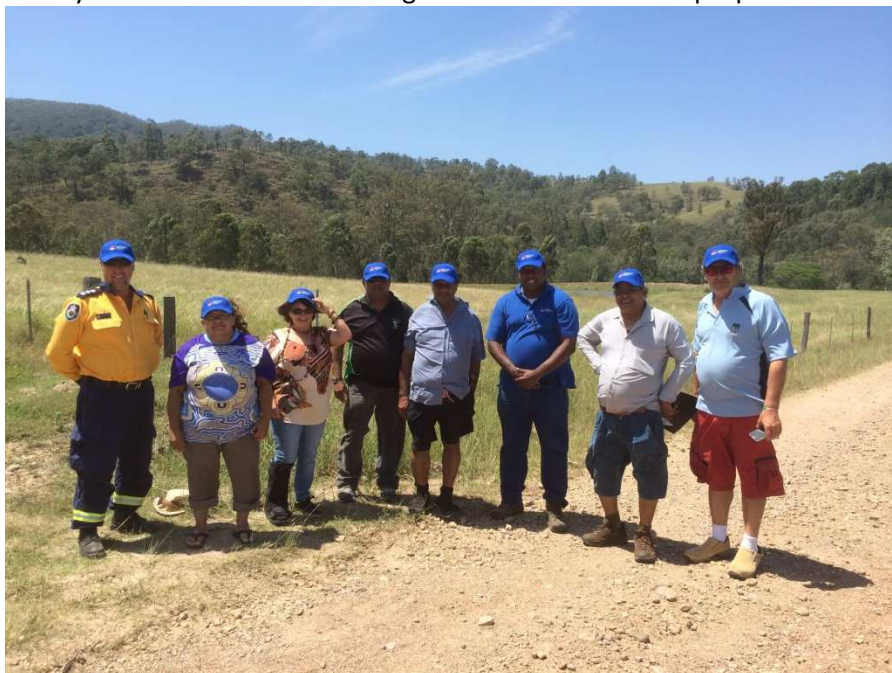
ACAG Photo at St Claire, Glennies Creek. -