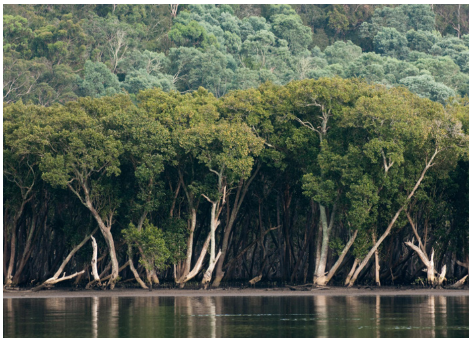
Lower Hawkesbury Nepean River

Scheme, the Landcare Coordinator Initiative, NSW Weed Action Program or the Saving Our Species Program.