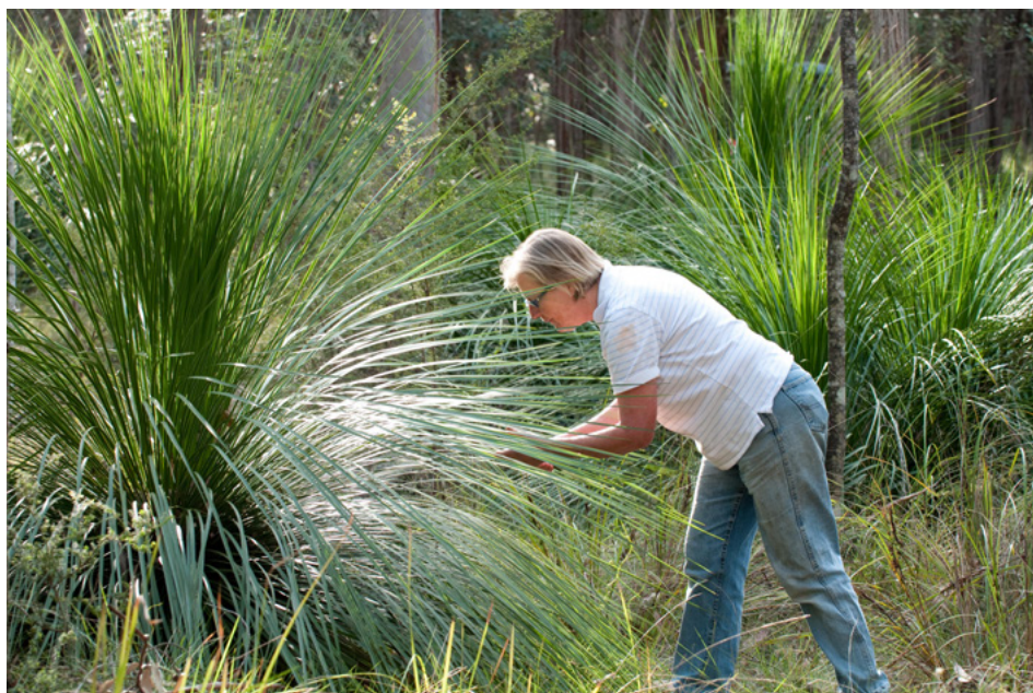
Grass Trees on Remony Farm, Kurrajong

GS LLS provides grant opportunities, generally in the form of funding, for works and activities that support and enable land managers to better manage these natural resources whilst maintaining land uses that are sustainable and productive, through its Natural Resources Management & Sustainable Agriculture (NRM & SusAg) Grants Program.