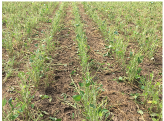
Figure 5. Cattle were removed from the demonstration crop at the Tabulam site as soon as they had eaten the green leaf.