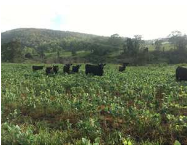
Figure 3. Angus weaners grazing soybean variety Hayman (b) at the Dowley family's property, Tabulam, NSW.

Studies have not yet been performed using cows and calves or adult dry stock, however, based on the recorded feed quality, grazing soybean crops offers a very high quality diet for these classes of cattle. The most profitable use of such high quality feed will depend on the farming system and business position of the enterprise.