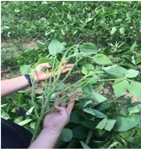
Figure 6. Soybean variety Hayman ready for grazing at 65 cm height and with at least seven branches developed from the main stem.

at Tabulam was grazed when it was approximately 65 cm high and at least seven branches had developed per plant (Figure 6). The main stem diameter was >5 mm. Seasonal conditions and planting times may vary the time to grazing.