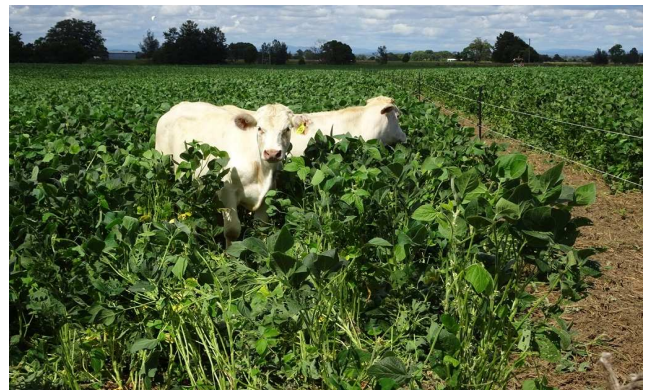
Figure 2. Soybean grazing and grain recovery trial, NSW DPI Grafton, February 2018.

The 2017-18 replicated trial at Grafton (Figures 1 and 2) utilised 46 crossbred yearling steers with an average live weight of 341 kg at the start of grazing. The six trial plots were 0.9 ha each in size (Figure 1) and eight steers were allocated to each plot, which resulted in a stocking rate of 8.8 head per ha and produced 192 kg/beef/ha over a 14 day period. During this study three day sickness (Bovine ephemeral fever) was widespread in the Grafton region and the steers in this trial were all affected to varying degrees, which likely reduced the recorded weight gains.