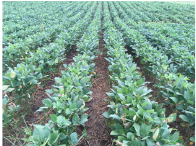
Figure 4. A row spacing of 80 cm was used in the demonstration crop at Tabulam. Photo taken at the commencement of grazing.

There was little to no evidence of entire plants being pulled out of the ground due to cattle grazing. Some plants were trodden down or knocked over but remained alive. Plants that were knocked over and remained alive developed lateral stems that later flowered and produced pods.