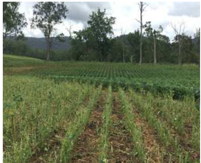
Figure 7. Soybean variety Hayman recovering after grazing. The background section is two weeks into recovery, and the foreground section is immediately after grazing.

If the crop is not required for grain, Hayman variety soybean can be grazed through flowering into early pod set. Caution is required if grazing during pod-fill, as the high oil content of the grain can disturb rumen function.