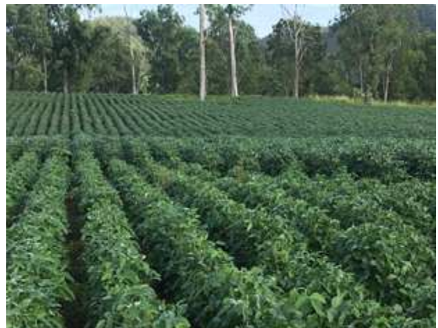
Figure 8. Soybean variety Hayman recovering after grazing. The background section is five weeks into recovery and the foreground section is three weeks after grazing.