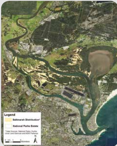
This map shows the distribution of saltmarsh in the Hunter estuary. The area of saltmarsh has reduced significantly – bad news for the fish and migratory birds that depend on it for survival.

Saltmarsh is a precious habitat and needs careful management to protect it now and for the future.