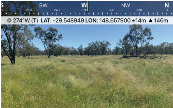
Walgett, Grazing Creek - 14 April 2021