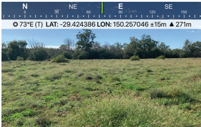
Gwydir, Old Boggamildi MAP, 12 May 2021