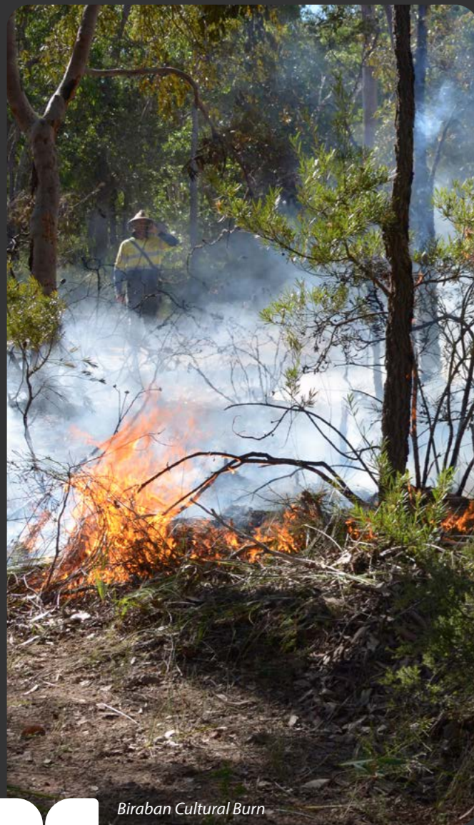
Biraban Cultural Burn

Applying traditional land management practices can assist landholders to manage weeds, promote native regrowth and improve biodiversity on their property. The steps involved in undertaking a cultural burn on private property are outlined on the flowchart. Most LALCs and other Aboriginal Organisations have Aboriginal Land Management Teams who can provide advice on cultural burns.