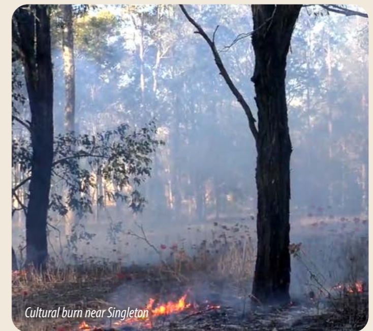
Cultural burn near Singleton