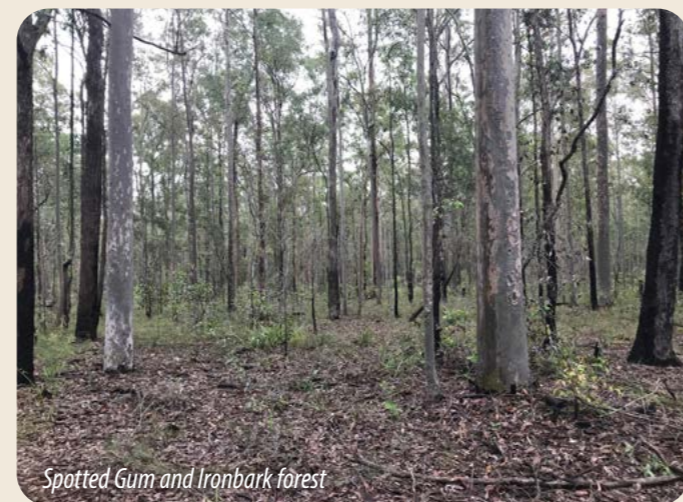
Spotted Gum and Ironbark forest